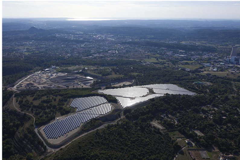
Figure 3. Installation of PV system on the Sauvaire dump in the Provence coal basin (France).

under the deposit. Before the installation of the PV panels, the pipeline was partially closed, and pumps were placed to evacuate water accumulating upstream, where 38,200 modules with a power of 9.36 MWp were installed. The solar power plant produces the equivalent of the electricity consumption of 50% of the city of Gardanne each year. The photovoltaic plant does not generate any additional hazards or pollution.