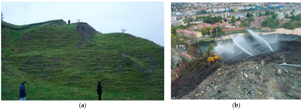
Figure 1. (a) Deep landslide in a dump, and (b) dump combustion, with watering and treatment to reduce the combustion risk.

and global landslides have been observed during and after abandoned mining activities. Between 2000 and 2008, 43 coal impoundment failures and incidents were reported in the USA [9]. The second major hazard is the fire and combustion of the dump material. Residues from coal and lignite mines are likely to be affected by in situ combustions and/or reactivation by external fire. The heaps most likely to burn are heaps of mine or pit constituted of products from digging rock galleries, coal tracks, and residues of the extracted coal.