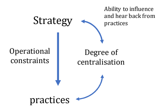
Figure 2. Strategy as a combination of operational constraints and degree of centralisation