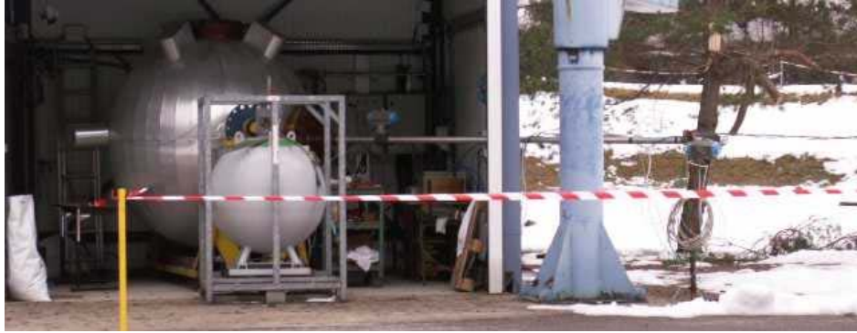
Figure 2: Experimental rig, including filling sphere and discharge pipe.

The relaxation time chosen to represent behaviour in the near-field of releases such as those considered herein was in the order of 10^{-3} s and obtained by the assessment of the rate that the calculated \text{CO}_2 saturation pressure relaxed to the local vapour pressure. In post-shock regions of the flow, a relaxation time of the order 2.5 s was chosen, representing the non-equilibrium state of the condensed phase.