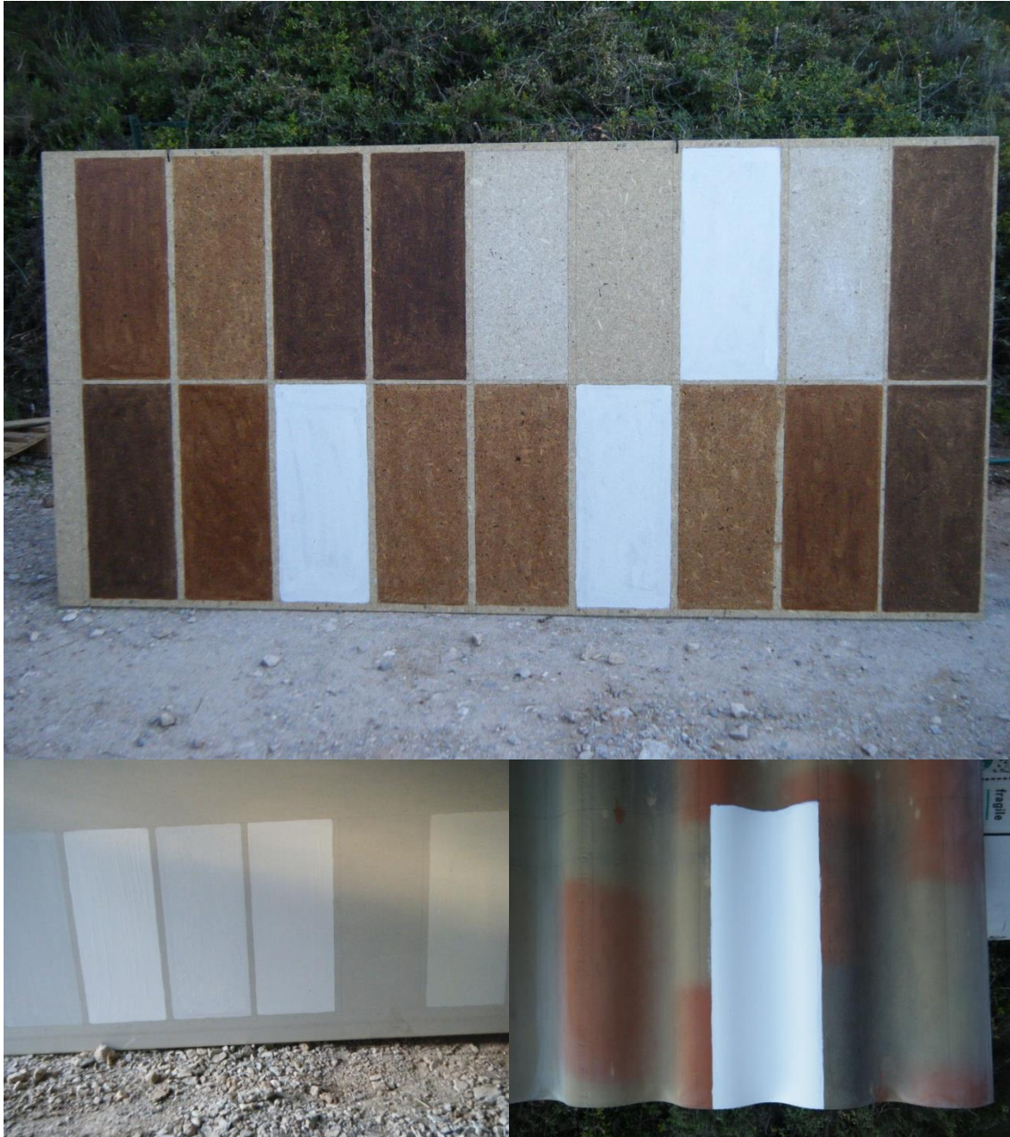
Figure 1 : Paints and varnished with ENPs additives, and paints containing ENPs on wood panel, plaster with cardboard, and cement plate