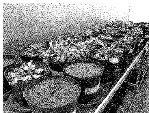
Figure 1. Arabidopsis halleri "Auby" growing on contaminated sediment in the growth room and non vegetated pots (sediment control).

as a non-accumulator control. Seedlings were also transferred to pots filled with agricultural soil to have a plant growth control. The design of the experiment is one seedling per pot and three replicates per origin and plant species. Soil and sediment moisture was maintained at 80% field water capacity with additions of regular de-ionised water after weighing. Plants were grown for 6 months in a controlled environment growth room (12h photo period; 20/16°C day/night temperature; 80% relative humidity).