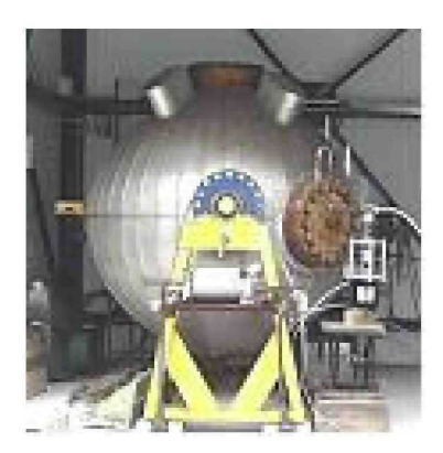
Figure 1: Experimental set up for leak quantification