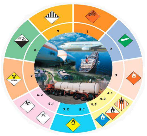
Figure 3: UN transport classification for dangerous goods

Regarding transportation of these pyrotechnic equipment the automotive industry requests to keep constraints at a minimum, in order to cope with the 'zero delay' delivery concept prevailing in the automotive industry. But, by nature of some of their components, these devices have to be viewed as dangerous goods regarding transport regulations. Early consideration of these products concluded to consider them as explosive objects falling in the Class 1 (Explosives) of the United Nations (UN)