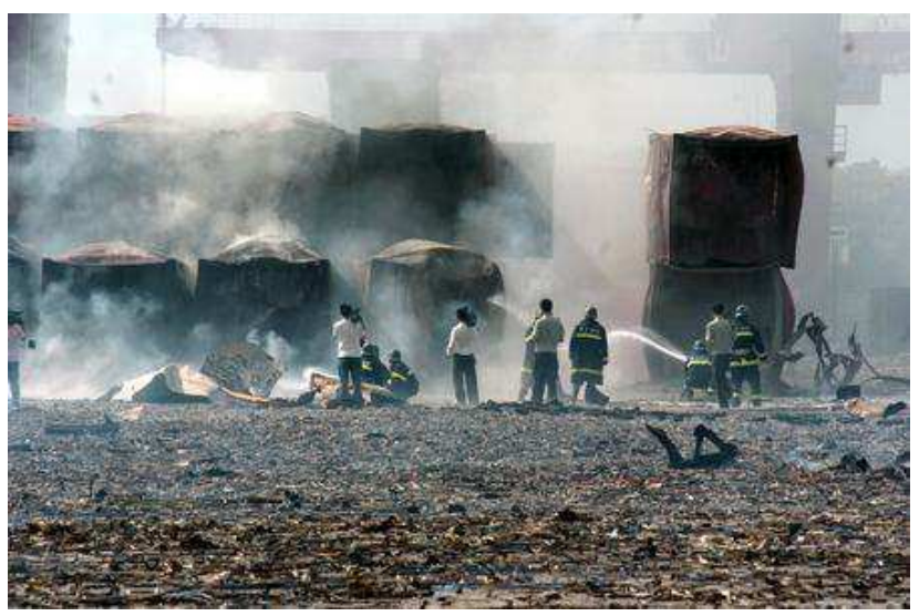
Figure 4: Fire in the Changsha harbour

Among recent accidents involving containers, the best-known is the one in the port of Changsha in 2006 where 200 containers have caused a significant fire after an explosion as initial event.