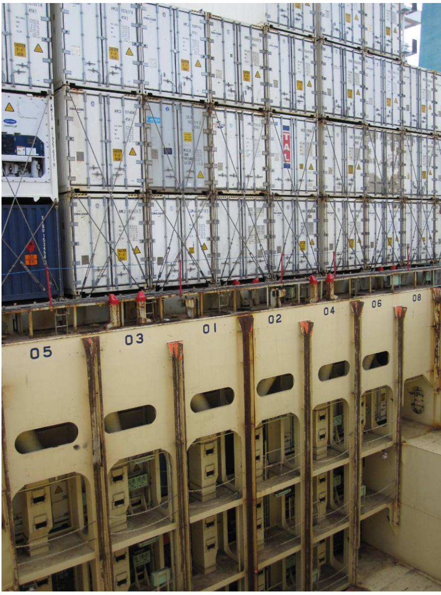
Figure 5: Containers above and below deck