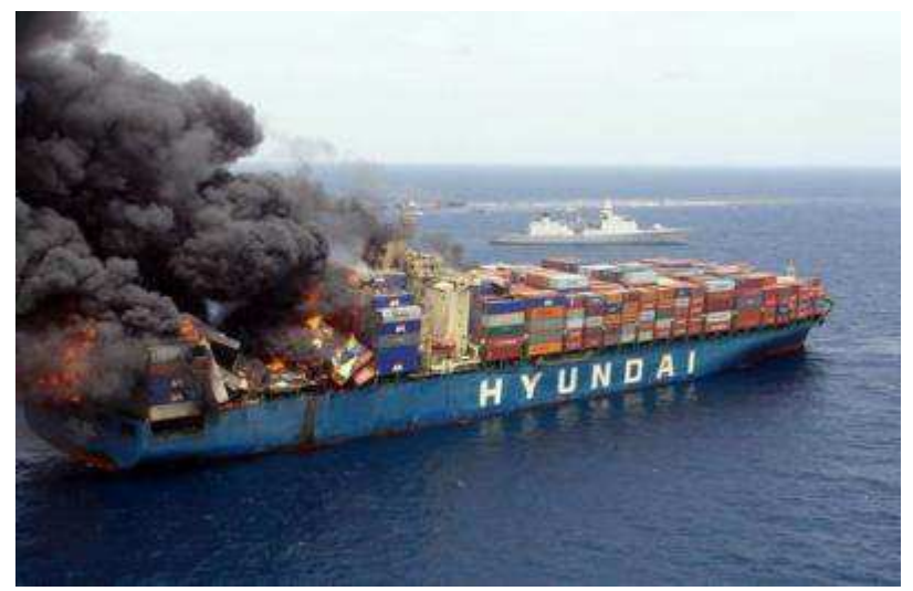
Figure 3: Fire in the Hyundai Fortune cargo ship

Among these accidents, very few deal with transport or storage of fireworks. The only known accident in a container ship is the HYUNDAI FORTUNE in 2006, 64 000 tonnes, bearing 5100 containers (in equivalent 20 feet), when an explosion near the YEMEN coast caused a fire that lasted several days. The ship had a cargo of 7 fireworks containers located in the area of the fire, but the actual cause of the incident remains poorly identified.