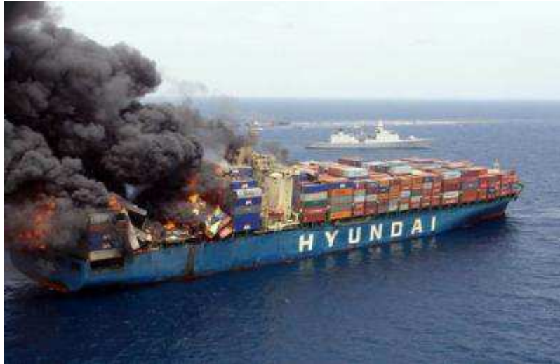
Figure 3: Fire in the Hyundai Fortune cargo ship

Among these accidents, very few deal with transport or storage of fireworks. The only known accident in a container ship is the HYUNDAI FORTUNE in 2006, 64 000 tonnes, bearing 5100 containers (in equivalent 20 feet), when an explosion near the YEMEN coast caused a fire that lasted several days. The ship had a cargo of 7 fireworks containers located in the area of the fire, but the actual cause of the incident remains poorly identified.