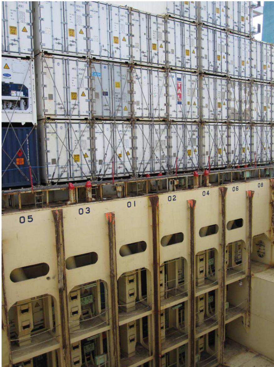
Figure 5: Containers above and below deck