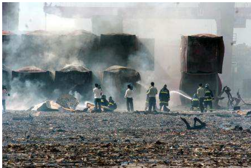
Figure 4: Fire in the Changsha harbour

Among recent accidents involving containers, the best-known is the one in the port of Changsha in 2006 where 200 containers have caused a significant fire after an explosion as initial event.