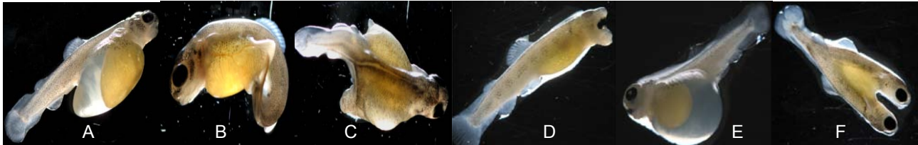
Figure 1. Different types of larvae abnormalities. A and E: yolk oedema in trout and charr respectively; B and C: trout spine deformation; D: charr jaw deformation; F: charr Siamese larvae

Embryo abnormality rate clearly increased in offspring stemming from MMS exposed male fish but remains at these development stages to a low value (for example, 0.6% in treated trout versus 0.2 % in control). Male exposure to MMS led also to a large array of abnormalities when measured at later stages i.e. after hatching and in particular during yolk resorption (Figure 1). Such an effect was significant only in trout and reached 2% of abnormal larvae.