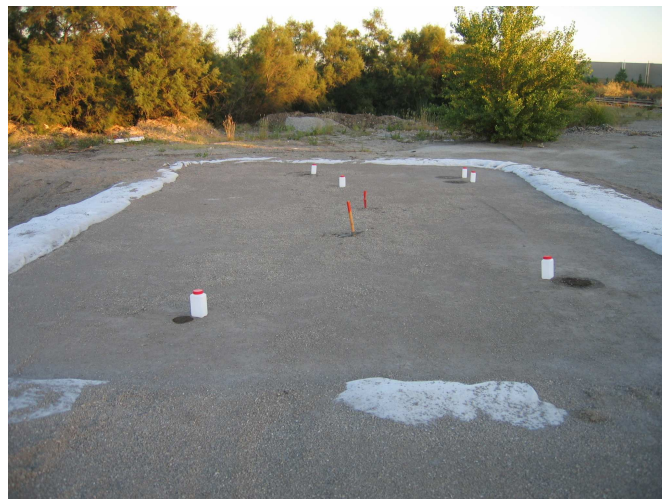
Figure 2. View of the experimental platform

The experimental site consists of an outside industrial platform, 10.9 x 6.4 m and 0.52 m thick, located in the southern part of France. The bottom of the work has been covered with a geomembrane and equipped with a drainage system in order to collect the stormwater percolating through the BOF slags. Two 0.26 m-thick layers of slags have been dumped in the platform and compacted (total mass about 70t). The bearing capacity of each layer was about 50 Mpa after compaction (plate-bearing test). The platform is unpaved and there is no traffic. The level of the water table is generally below 2 m at the site. The dry bulk density average 1.88 \text{ t m}^{-3} , which is not so far from the optimum proctor bulk density.