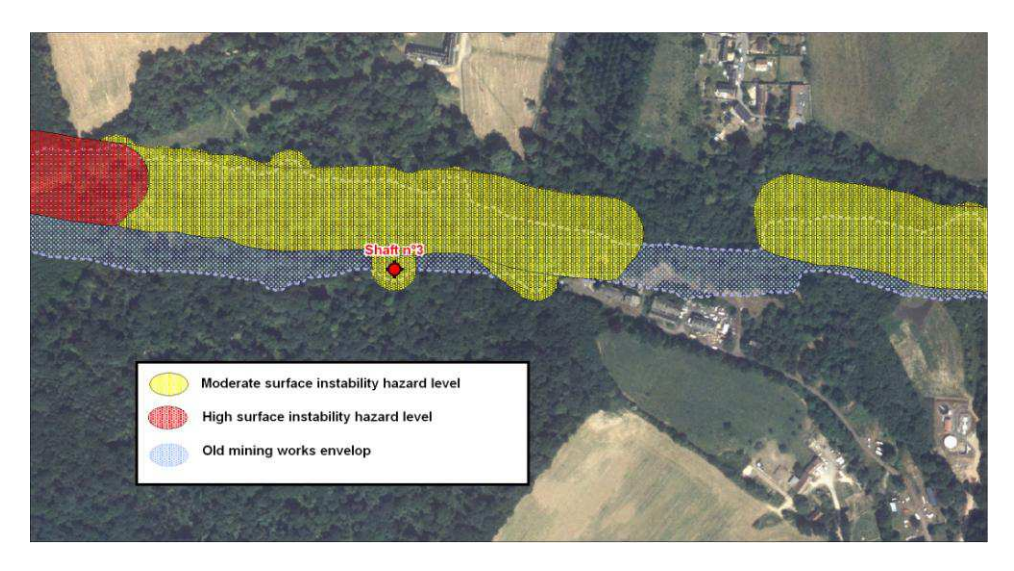
Figure 5. Example of a hazard map above abandoned iron mines (North-West of France) .

The hazard evaluation stage aims to locate and hierarchise the exposed zones, according to the intensity of the foreseeable phenomena and their pre-disposition to occur in each zone. This evaluation stage does not integrate the nature of surface occupation. It leads to the establishment of hazard maps which locate the hazardous zones.