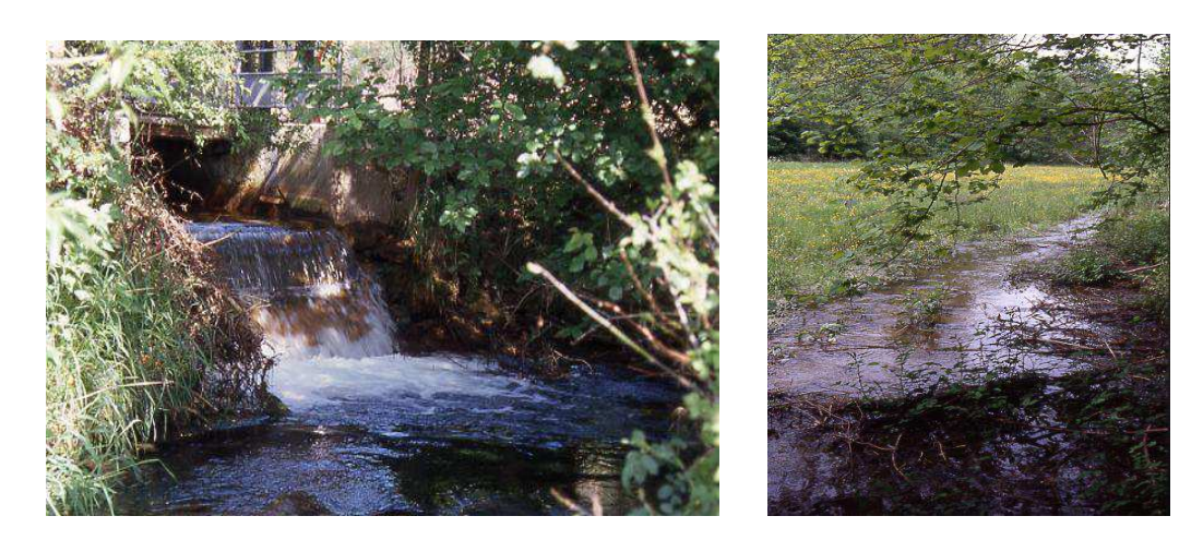
Figure 2. Discharge through an adit (left) and development of a wet zone close to an other adit (right).

All those possible effects justify easily the very careful attention that has to be paid to the possible consequences that the water table rising is able to induce on the goods and activities located on surface in the surroundings of the abandoned exploitation.