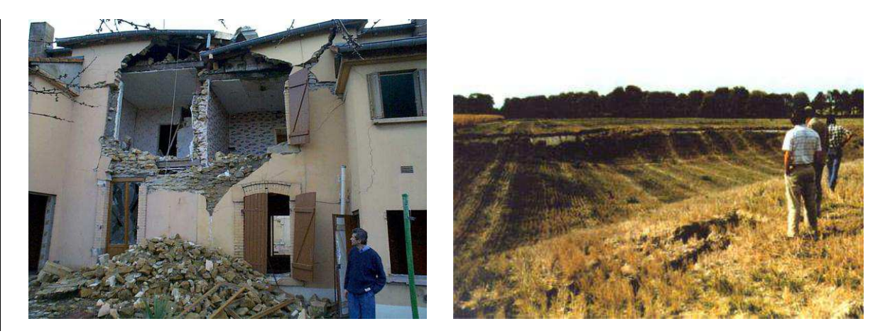
Figure 3. Effect of severe subsidence in Lorraine iron field (left) and major collapse of a chalk mine (right).

Concerning open pit works , the extraction consisted in creating pits within which the ore was located. The choice of the mining method resulted from an optimization between economical profit (to limit the volume of rock to remove) and the stability of the mining works (to avoid too sloping cliffs). The rock faces often generate, at long term, ground instabilities which can take the form of rockfalls of very different volumes. The combination of rock type and design of rock faces determines the volume of the potentially unstable rock masses.