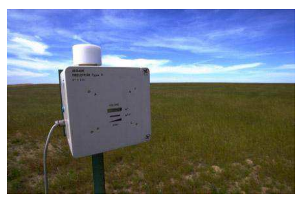
Figure 4. Effect on surface water of an abandoned coal mine discharge (left) and monitoring of ionizing emission above restored tailings (right).