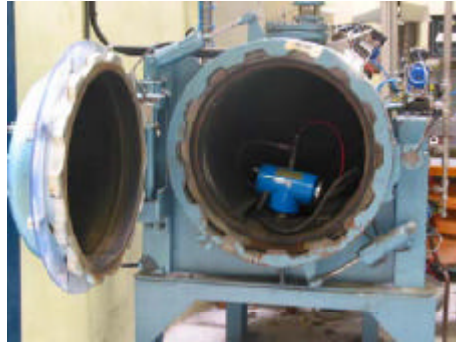
Figure 3: Front view of a typical test chamber to test ignition potential of equipment

Tests will be carried out inside an explosion chamber dedicated to test electrical or mechanical equipment. The picture below features a typical test chamber.