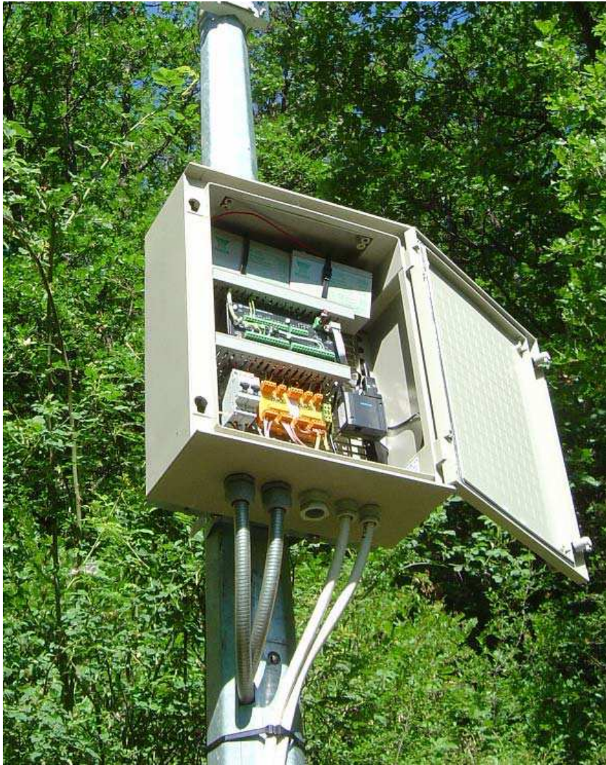
Figure 7. Box that protects electrical and electronic elements.