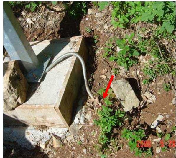
Figure 6. Sensor in the soil