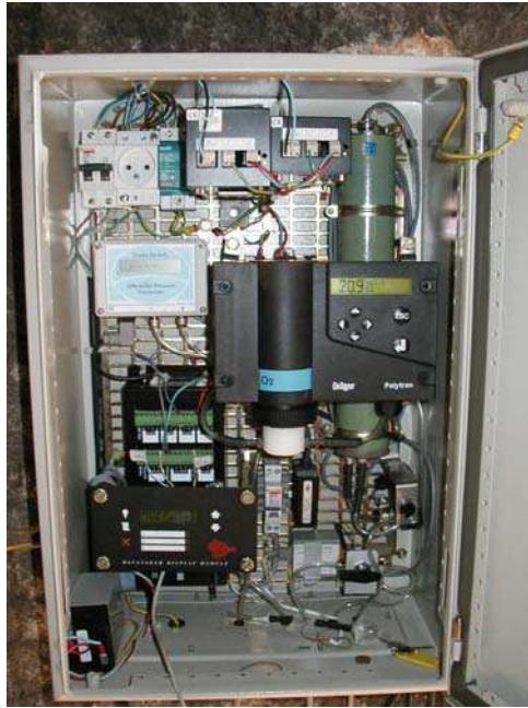
Figure 2. Automatic continuously operating station at Moyeuivre-Grande