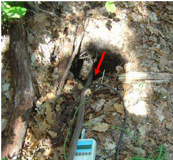
Figure 5. Sensor in a fumarole