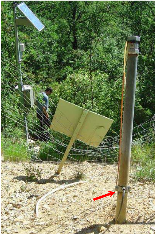
Figure 3. Temperature sensor at the entrance of the gallery