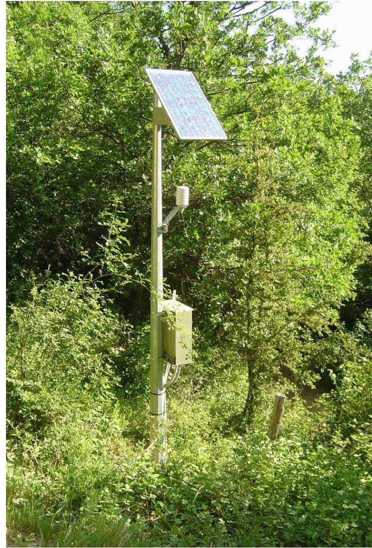
Figure 8. Whole view of the station