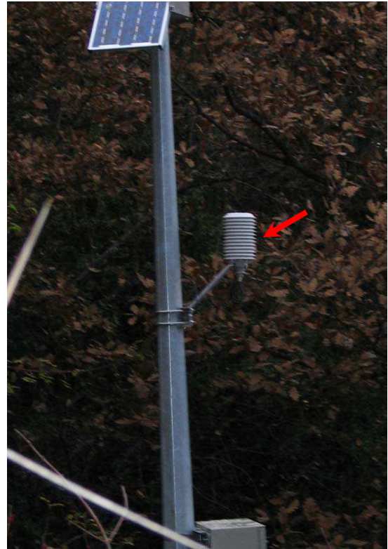
Figure 4. Outer temperature sensor