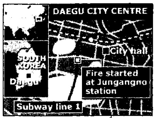
Figure 2: location of the fire in the city of Daegu, 3<sup>t</sup> town agglomeration of Korea

The accident took place on the 18<sup>th</sup> of February 2003, close to 10 a.m., at the level of the Jungangno station of line 1 linking Daegu Si to Jung Gu Namil Dong (see figure 2), comprising 30 stations in total.