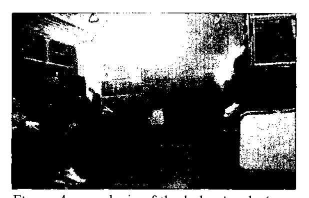
Figure 2 illustrates the burn out process that affected most of carriages of the trains affected by the fire.