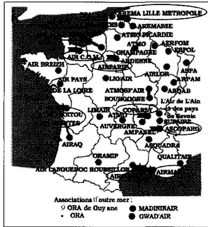
Figure 1. Air quality monitoring networks in France

Le développement d'une stratégie nationale de surveillance des HAP est une des missions du LCSQA depuis plusieurs années, avec l'accompagnement d'un programme pilote, qui vise à mieux connaître les niveaux de concentration dans l'air ambiant, à définir et valider des stratégies de prélèvement et d'analyse, à quantifier les incertitudes et à évaluer les coûts.