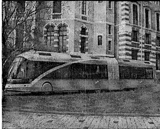
Figure 1: Trolley bus – The Civis Cristalis

The proposed vehicle is a twelve meter articulated bus (see figure 1 below). It results from the combination of a trolley bus (external electrical power supply) and a fuel cell system. The power system is an hybridation between a 75 kW PEMFC and batteries. Batteries are a mean to recover braking and deceleration energy. They also supply additive power for peak demand.