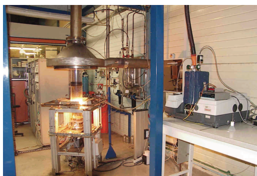
Figure 3. Teawarson calorimeter and TFIR metrology