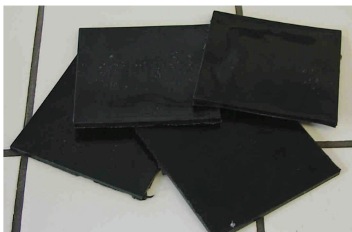
Figure 1. Kind of elaborated samples