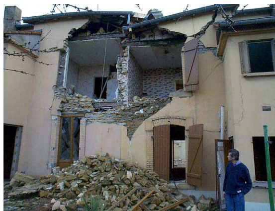
Figure 1 : Damages generated by Auboué subsidence

About 70 buildings had to be demolished and 150 families, victims of damage, had to be re-located (figure 1). In the following months, other instabilities developed in the nearby cities of Moutiers (90 other families moved in may 1997), Moyeuvre, Roncourt, etc. Other types of disorders also developed at the same period: flood of basements, oxygen-deficient air in cellars connected to the mining galleries due to mine gas accumulation, etc.