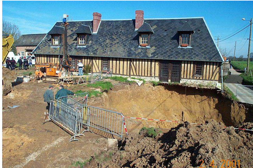
Figure 3. Sinkhole in a French urban area.

For the first one (e.g. longwalls), surface instability is often limited to continuous subsidence (able to damage buildings and infrastructure) that take place mainly during mining activity and reaches a stable state quite rapidly. For operations leading to large persistent residual voids (e.g. rooms and abandoned pillars), the mine workings stability may be affected by a bad design and the “rock weathering effect”. Apart from subsidence possibility, this type of operation may also be the source of discontinuous subsidence (e.g. sinkholes, massive collapses) that may develop long time after closure. This is why those potentially dangerous events (figure 2) are very difficult to predict (Didier and Josien, 2003).